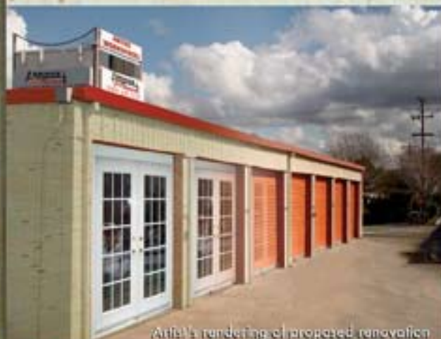
Artist's rendering of proposed renovation

Booth spaces still available. Secure parking and facilities.